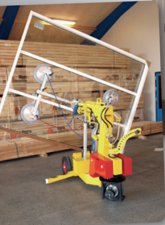
The lifting device has a multifunctional swivel head.