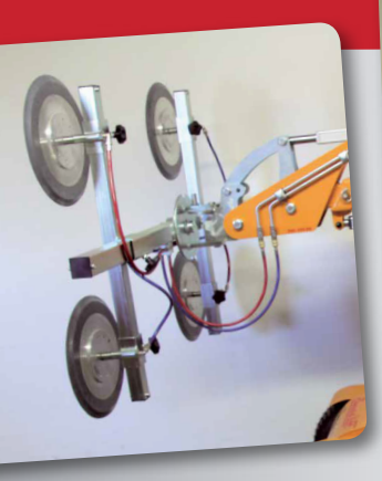
The vacuum system is separated into two circuits (separate blue and red hoses) for the highest level of security.