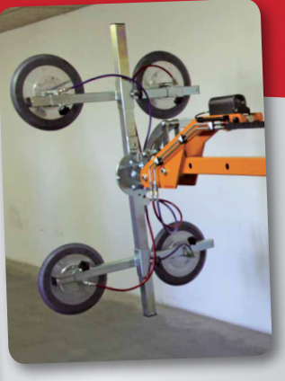
The yoke allows multidirectional movement.