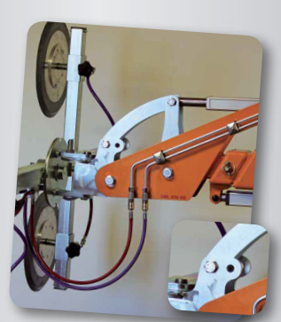
The lifting head has two settings with adjustable locking bolts. The head can be tilted towards the ceiling or floor.