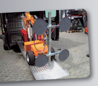
The compact Smartlift design allows for easy transport by van or trailer.